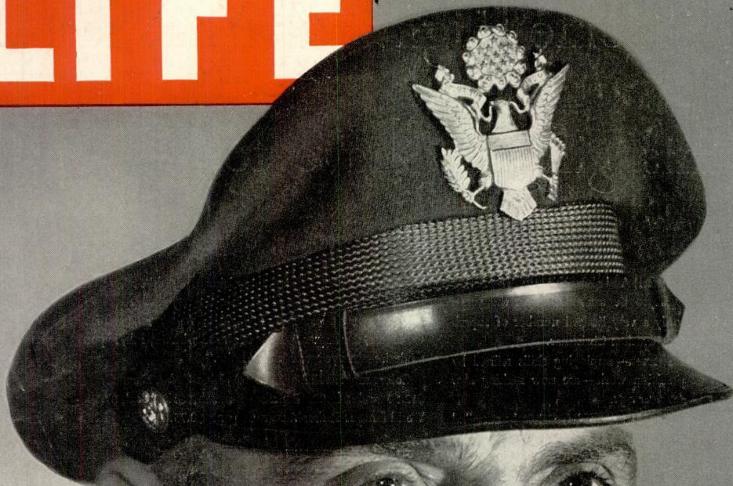
LIEUT. GENERAL EAKER EIGHTH AIR FORCE

NOVEMBER 29, 1943 10 CENTS YEARLY SUBSCRIPTION $4.50